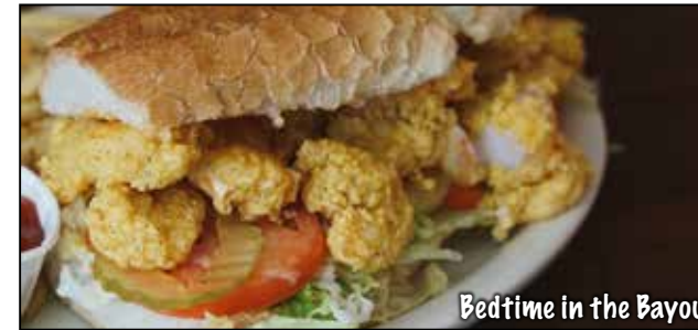
Bedtime in the Bayou

Served with fries (excludes Po'boy & Gumbo Combo)