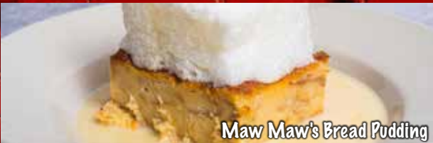
Maw Maw's Bread Pudding