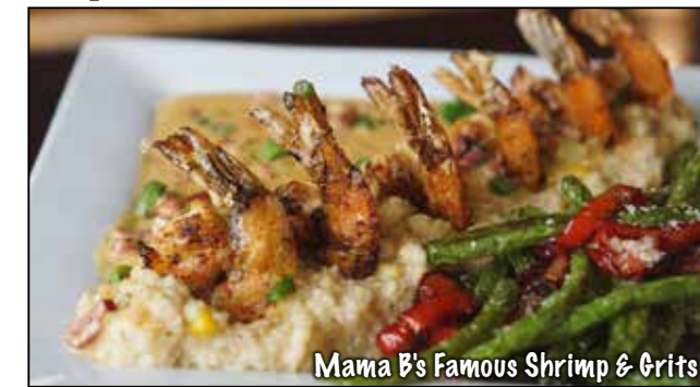
Mama B's Famous Shrimp & Grits

Outside skirt steak, chimichurri sauce, cilantro pineapple white rice, choice of one side. 20.99