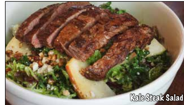
Kale Steak Salad

Citrus cured fish, pico de gallo, jalapeños, avocado, served with tostadas. 9.99