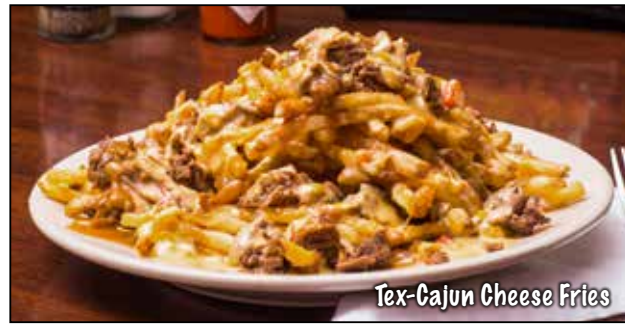
Tex-Cajun Cheese Fries